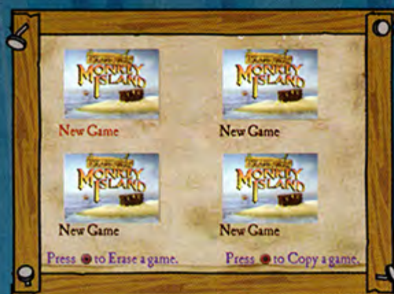
Start Game Screen

After you start the game, you'll reach the Start Game Screen. Here, you choose a previously saved game to play or start a new one. To move between slots, use ▲ and ▼ on the Directional Buttons , R1/R2 or ◀ and ▶ on the Left Analog Stick . Press the × Button to select a saved game to play. Press the □ Button to erase an existing game. Press the ○ Button to copy a game.