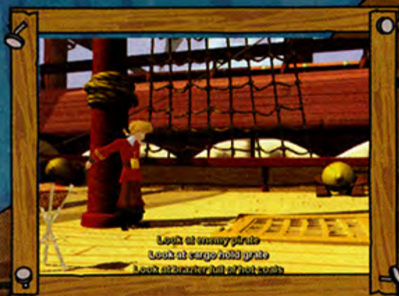
Interact with Objects

Occasionally, Guybrush finds himself in a vehicle of some sort. In vehicles, directions for movement are compass directions. In other words, if Guybrush rows a boat and heads north, that boat would head towards the top of the screen. If he rows east, that would mean the boat moves to the right of the screen.